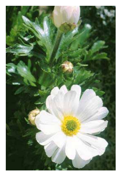
Apline endemic species the Anemone buttercup