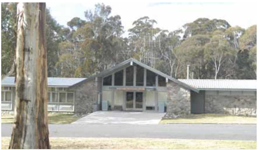
Kosciuszko Education Centre at Sawpit Creek

We usually videotape the students' presentations during this program. The only copy of this tape is sent back to school with the teacher for revision purposes. If the teacher, students or parents would prefer that this session, or particular students, are not filmed please let us know before the program day.